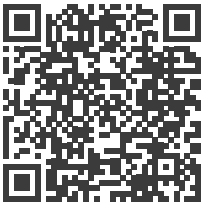
CMS MTF User Guide

For step-by-step guidance on how to enroll, click or scan the QR codes below to review the following resources: